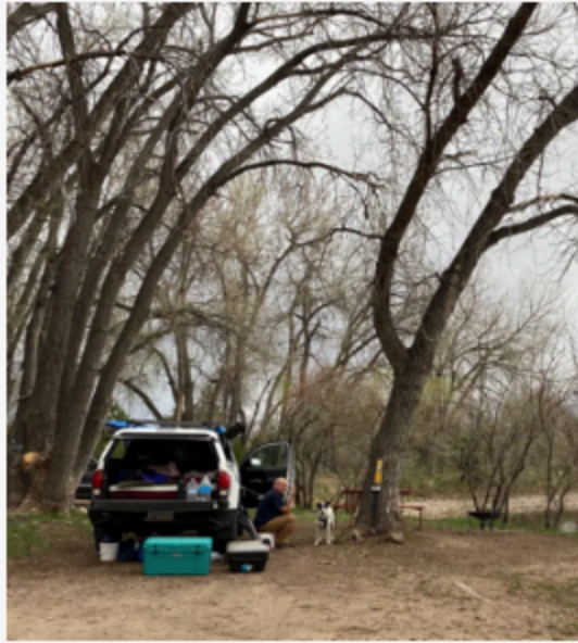
Truck camping in Fort Collins, CO