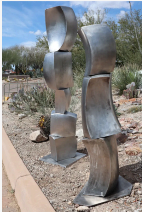
"Herald" and "Muse" at Hacienda del Sol