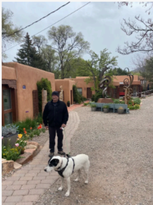
On Canyon Road in Santa Fe