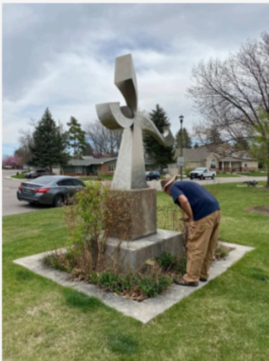
At Benson Sculpture Garden