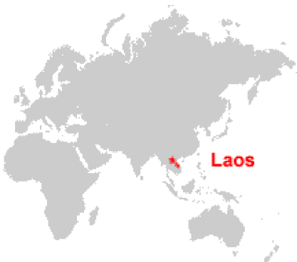
Map of Laos