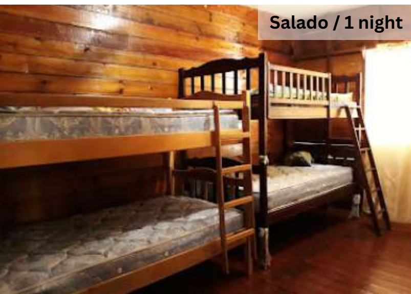
Salado / 1 night