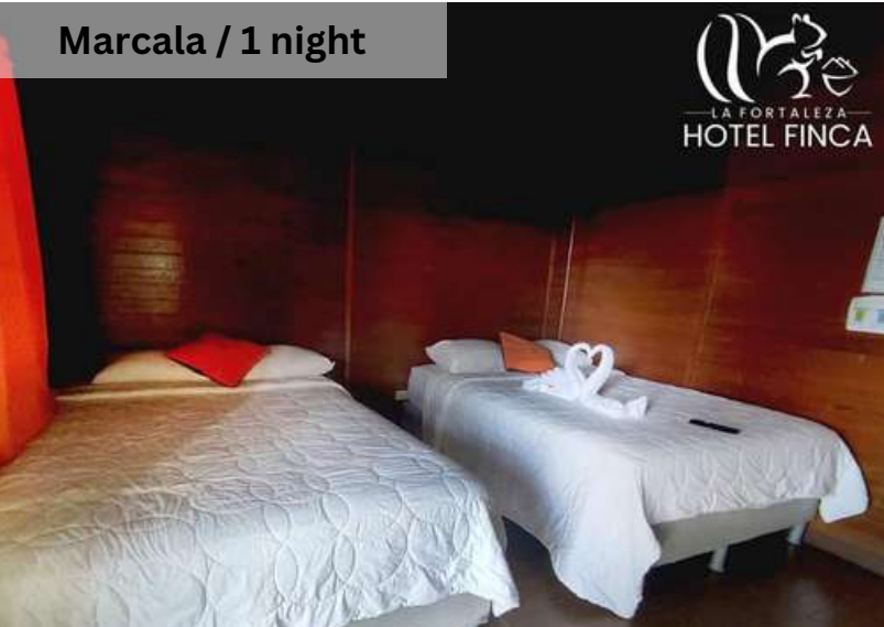
Marcala / 1 night