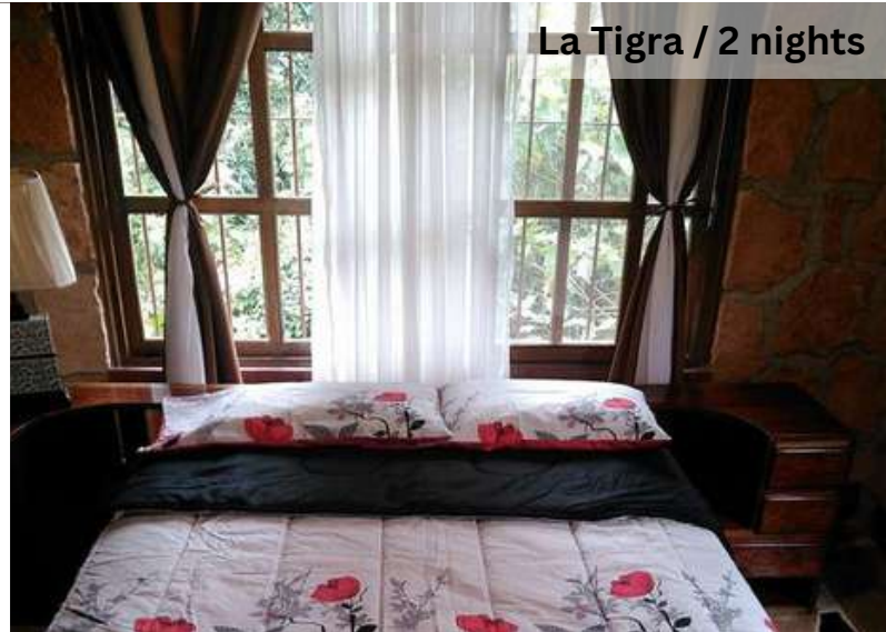
La Tigra / 2 nights