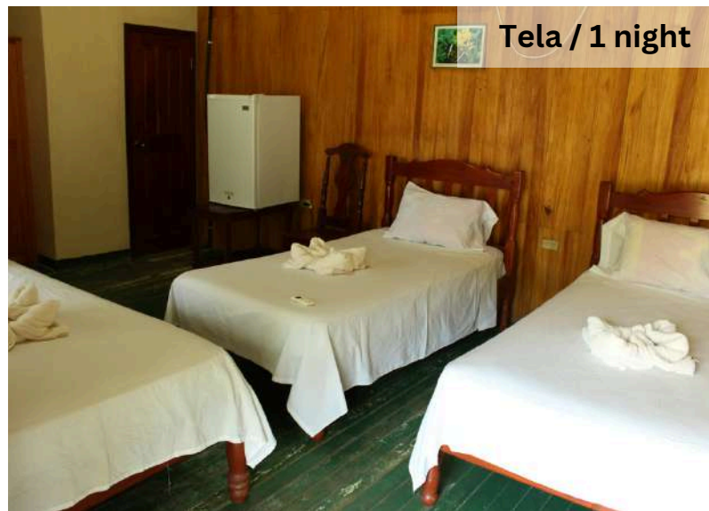
Tela / 1 night