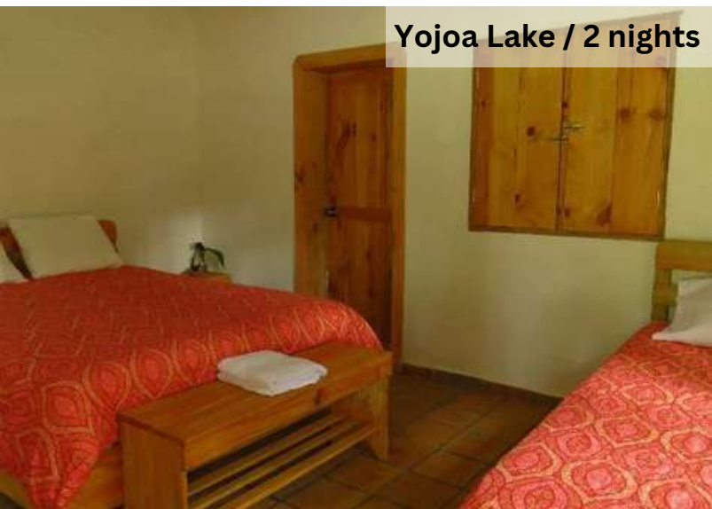
Yojoa Lake / 2 nights