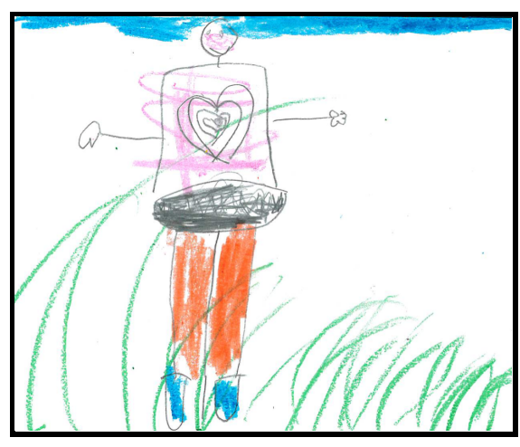
"Misty Copeland" By Rae'vn