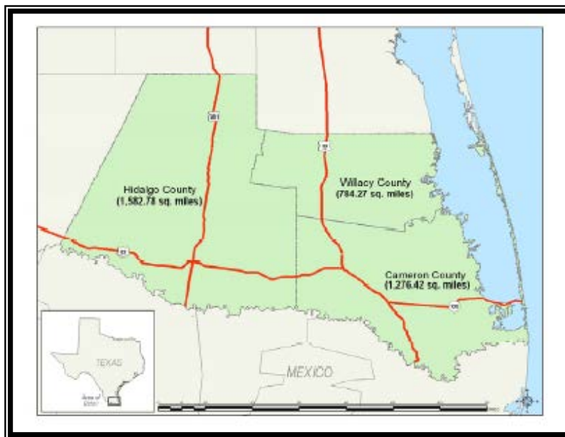
Figure 1-1: Lower Rio Grande Valley Project Area (LRGVDC, 2003)

The Lower Rio Grande Valley (LRGV) is growing at an incredible rate and by the year 2020 it is estimated that the population will exceed 1.6 million people (LRGVDC, 2003). The 2000 U.S. Census indicated that the population of the LRGV (Figure 1-1) was 924,772, and according to the Texas Water Development Board (TWDB), the population of the Rio Grande Region M (Figure 1-2) will increase by 142% by the year 2060. The population boom in South Texas has forced decision-makers to prioritize environmental concerns due to lack of local, state and federal resources. The top three concerns identified by the Texas Commission on Environmental Quality (TCEQ) in the Lower Rio Grande Subregion are water quantity, water quality, and illegal dumping of municipal solid waste (TCEQ, 2002).