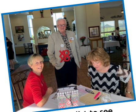
Checking the list to see whose naughty or nice!