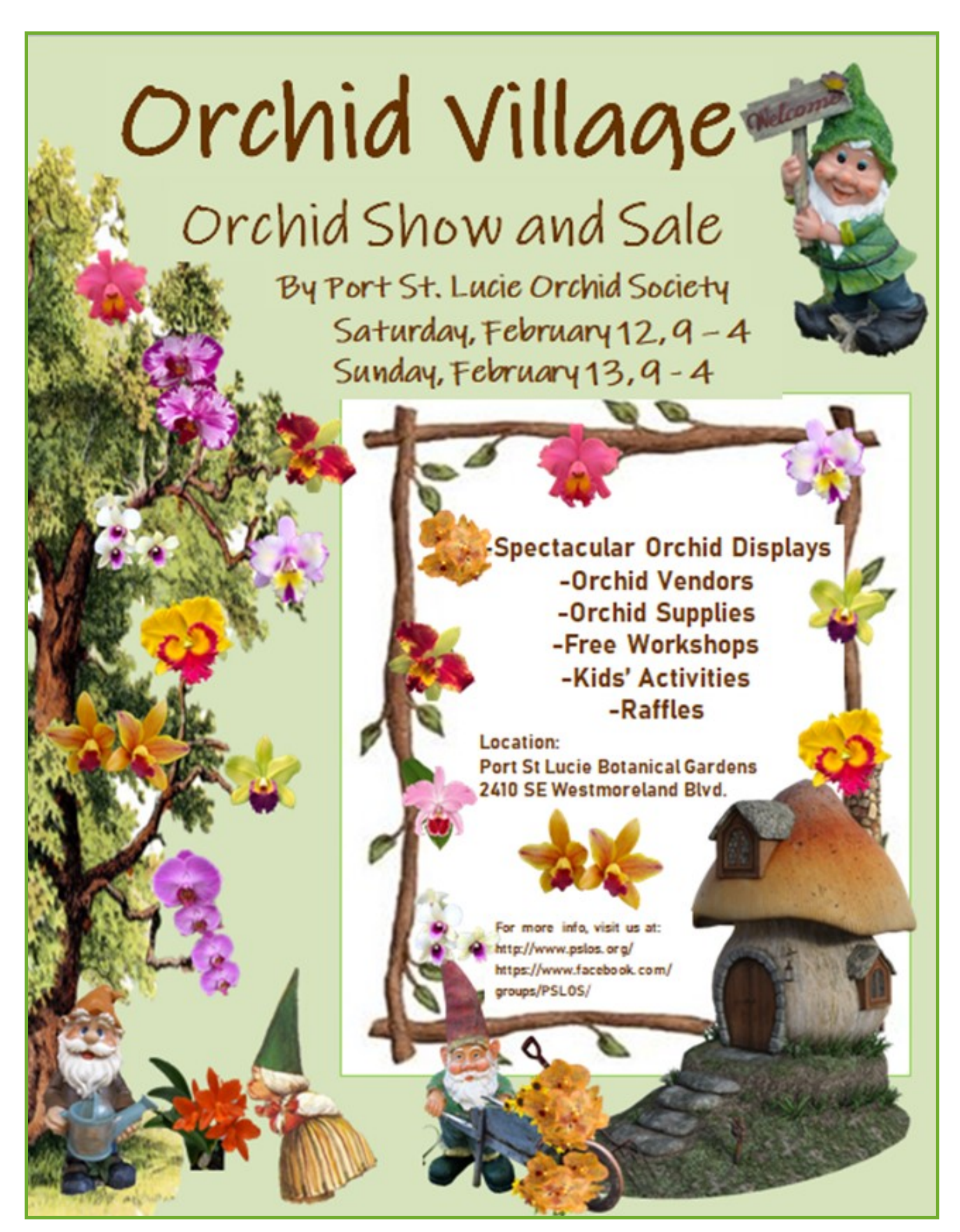
Make copies of the show flyer and share with your friends!