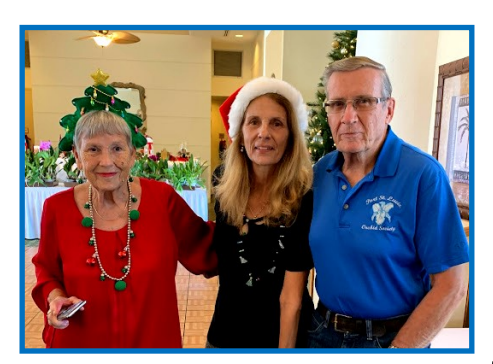
Thanks to Santa's helpers!