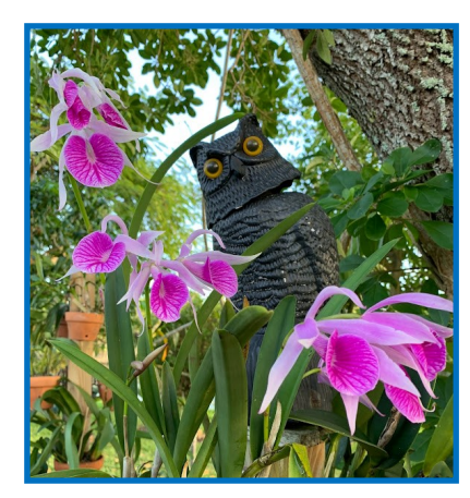
Wise owl keeping watch for Diane Bryant!