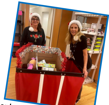
Thanks to all for the toys donated for the Salvation Army's toy drive!