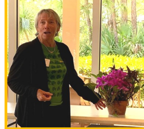
Show & Tell is always fun! Look at these great growers!