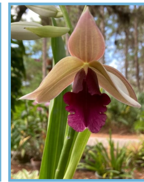
Thanks to all our volunteers who help make our Orchid Room look great!