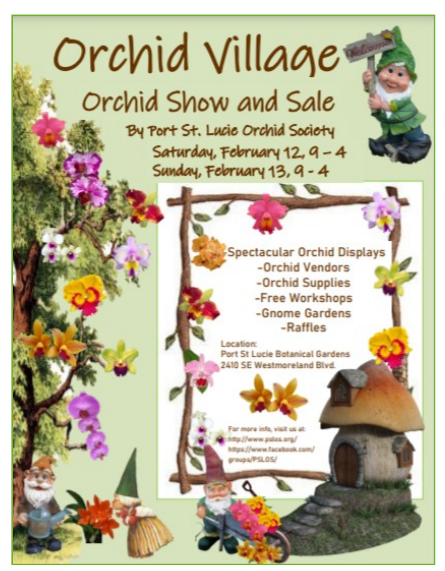
Make copies of the show flyer and share with your friends!