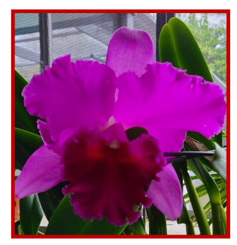
Laurie Wade's Collection