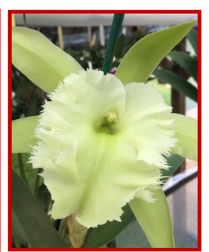
Judy Wagner's Collection