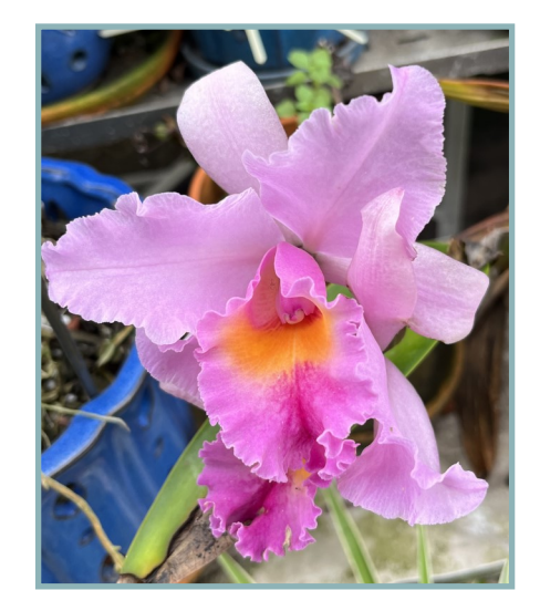
From Nan Rothschild's Collection

We love to see our members' orchids, especially if you can't bring them to "Show and Tell". Send pictures to pslosdiane agmail.com.