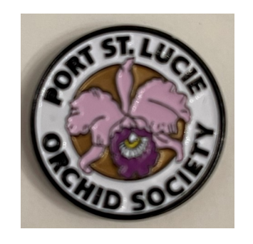
10 Year Pin