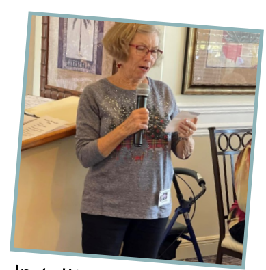
Installing the 2023 officers.