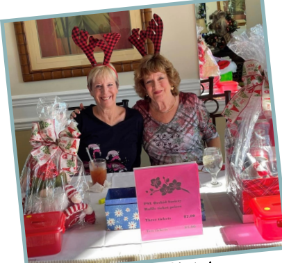
Checking the list to see who's naughty or nice!