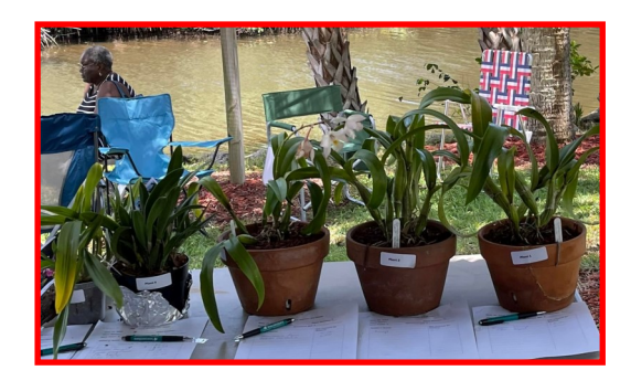
Great silent auction and raffle!

Our raffle netted $154, and the silent auction netted $82 profit.