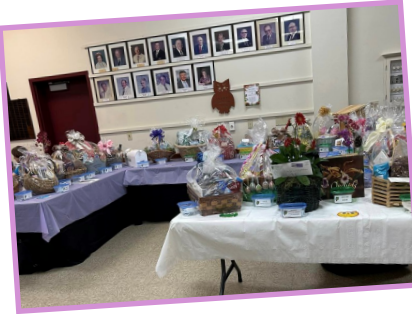
Thanks to Jackie, Shelley, Illona, and many others for setting up the raffle table and selling raffle tickets.