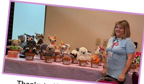
Thanks to Nan for crocheting all those great owls!