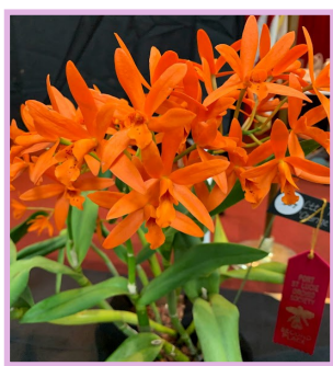
<u>Dana Demarco</u> 2nd Place - Ctt. Trick or Treat 'Orange Magic' AM/AOS