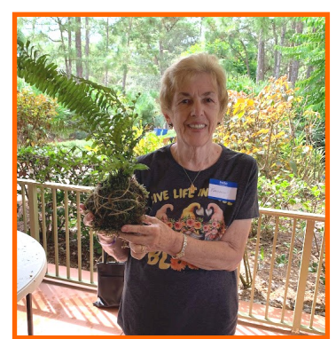
Check out the video of the event: <a href="https://youtu.be/l5V14HPfC-l">https://youtu.be/l5V14HPfC-l</a>