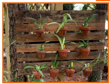
Using our imagination to display our potted orchids and our vanilla orchid.