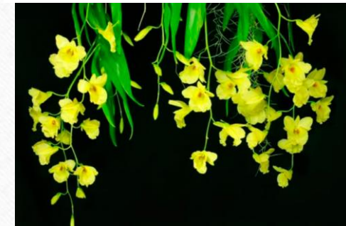
Den Section Nobile Seminobile