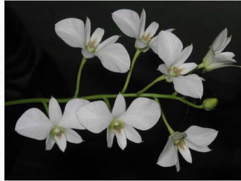
Den. Affine (White Butterfly)