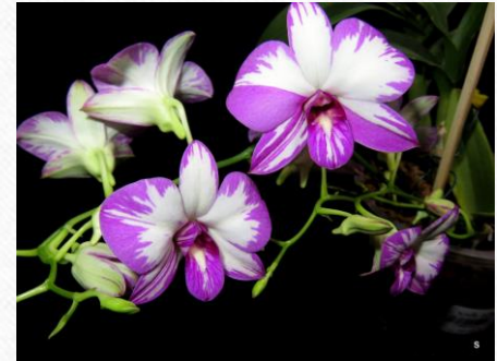
Den. Enobi Purple 'Splash' AM/AOS