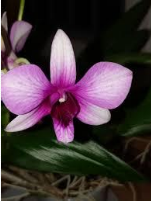
Den. Biggibum (Used extensively for Hybrids) (Also known as Den. Phalaenopsis)