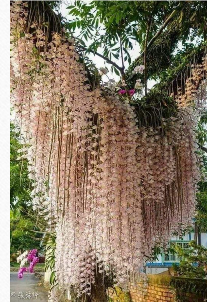
From Batam Island, Kepulauan Riau - Indonesia