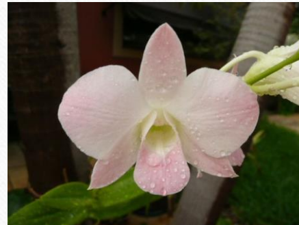
Den. Baby Pink