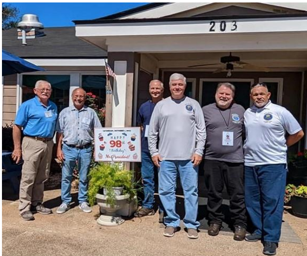
Outside of Bonita's Restaurant, Plains, GA