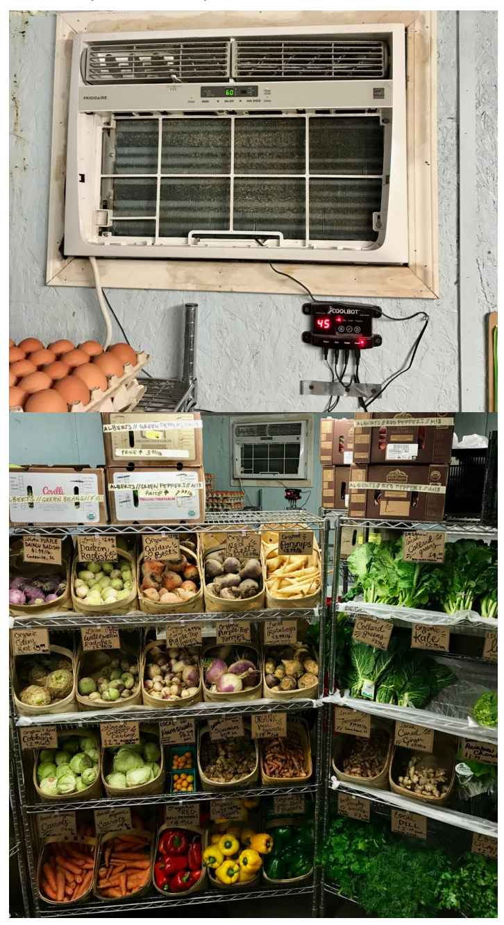
Photo 3.3. Swamp Rabit Cafe and Grocery's Produce Room with an A/C unit and CoolBot® controller.

Given that doors to the Produce Room are opened frequently, much more than the recommended six time or less per hour, the CoolBot<sup>®</sup> has worked well over the five and a half years in operation. Owners do believe they have replaced the A/C unit once and at times moisture has been an issue since the room is located on the interior of the building.