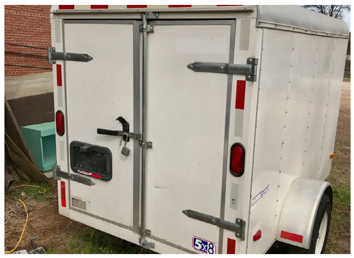
Pack N' Cool: https://plantsforhumanhealth.ncsu.edu/2012/08/20/pack-n-cool/

Double doors are preferable for mobile cooler use (Photo 3.5). Opening one door does not result in nearly as much cooling loss as having to lower the ramp door each time products are loaded or unloaded. Additional insulation can be added to the door by installing a heavier or thicker gasket around the edge of the doors. (Photo 3.6)