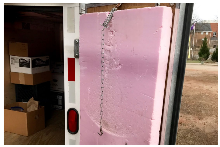
Photo 3.7. Interior of the mobile cooler with plywood floor and walls, XPS insulation, an A/C unit and taped sides.

Photo 3.6. Two inches of XPS affixed to the interior of the door for increased insulation.