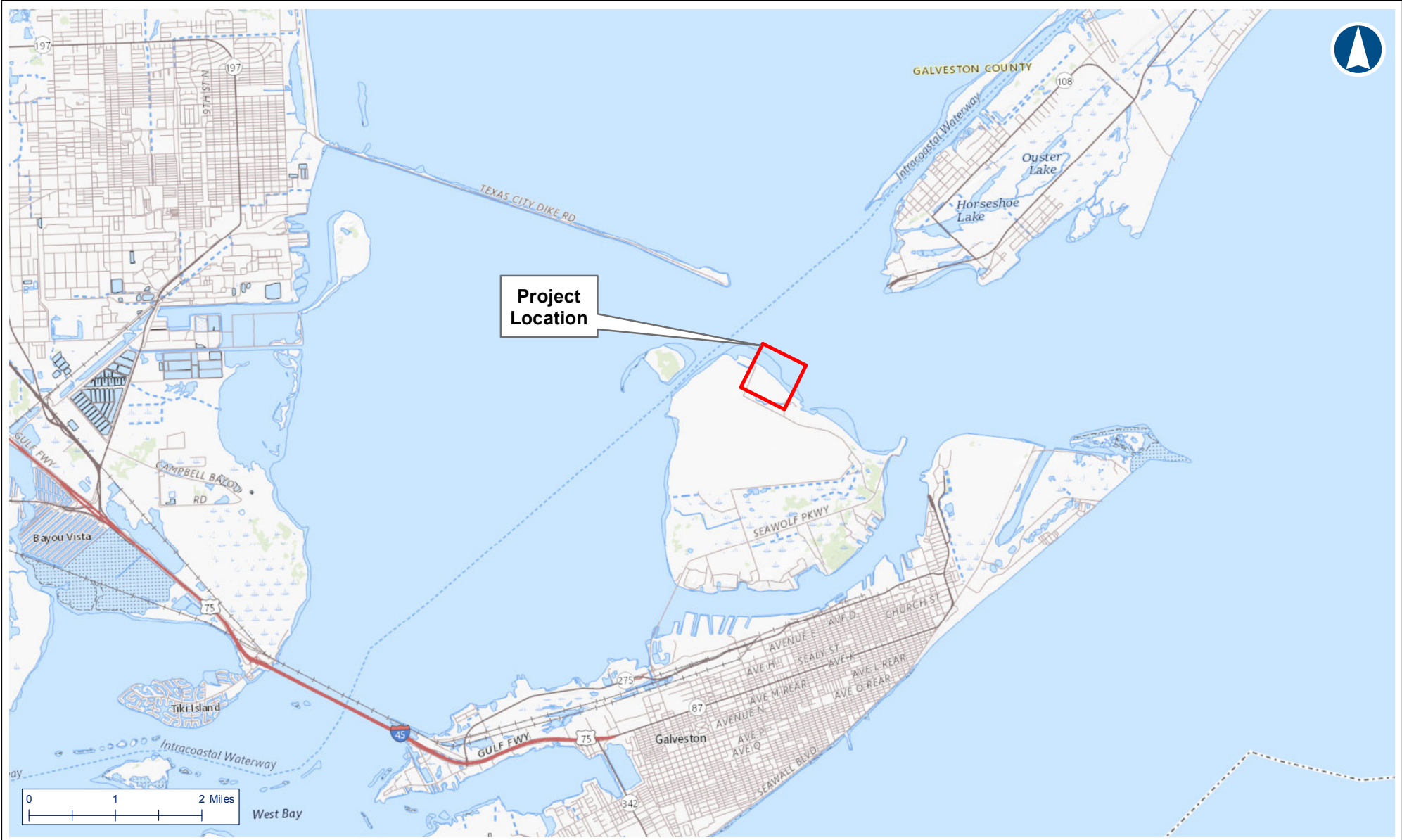
FIGURE 1-3: VICINITY MAP - GALVESTON LNG BUNKER PORT