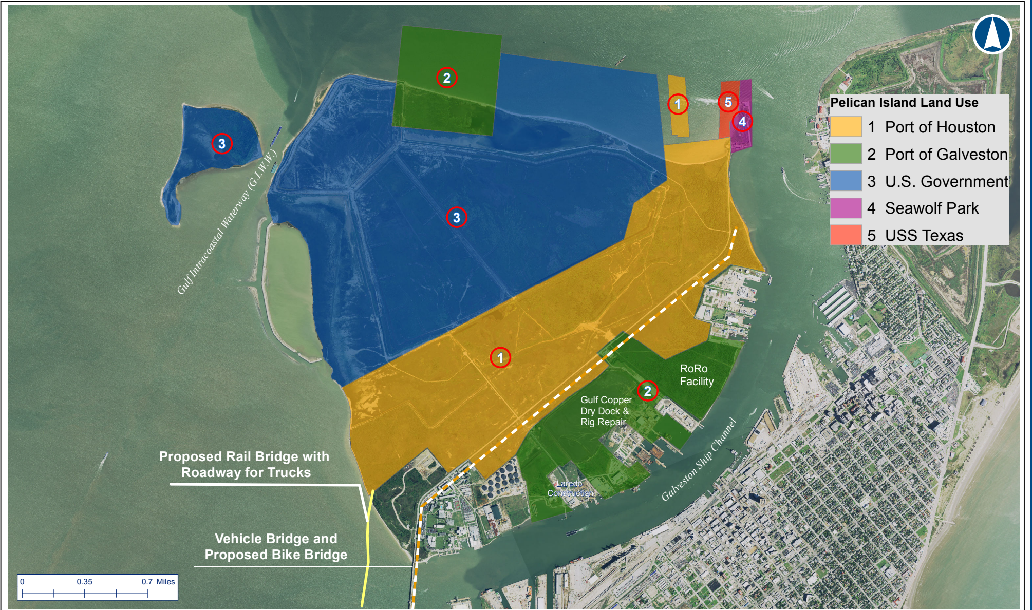
FIGURE 1-7: PELICAN ISLAND LAND USE - GALVESTON LNG BUNKER PORT