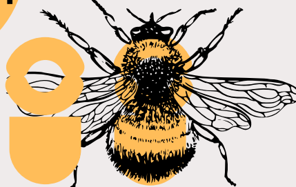
Moss carder bee