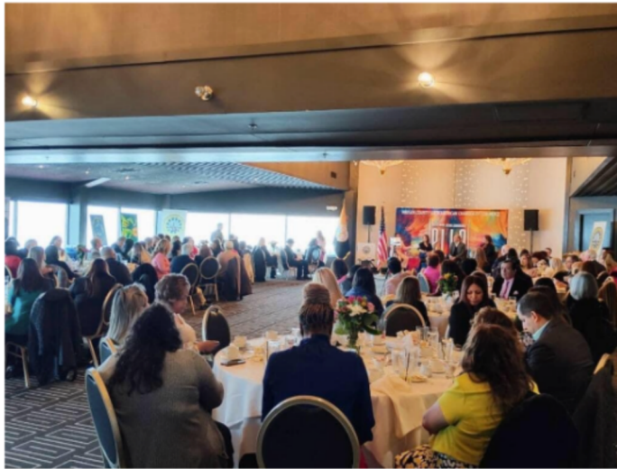
ELLA Conference at Chart House - Weehawken, NJ - March 5th, 2024