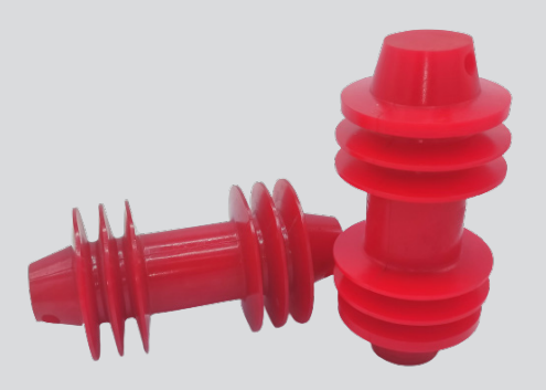
Solid Cast Batching Pig