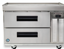
CRES36 36.5" W x 33.25" D x 26" H