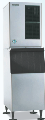
KM-515MAH on B300 22" W x 27.4" D x 30.3" H