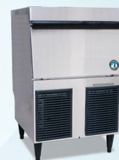
F-330BAJ 24" W x 26" D x 39" H