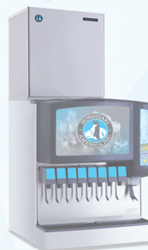
FD-650MWH on Lancer dispenser 22" W x 24" D x 26" H