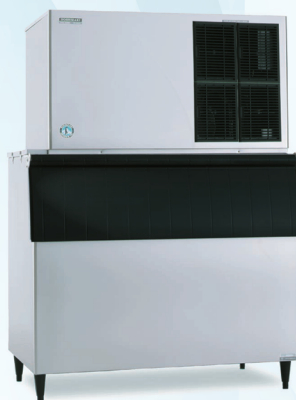
KM-1301SAH on B800 48" W x 27.4" D x 27.4" H