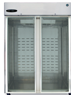
CR2S-FGE 55" W x 34.75" D x 79.75" H