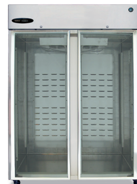
CR2S-FGE 55" W x 34.75" D x 79.75" H