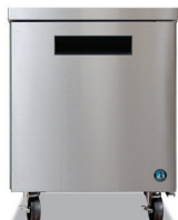
CRM27 27" W x 30" D x 33.63" H