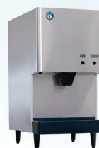
DCM-270BAH 16.7" W x 24.1" D x 31.7" H

Our crescent cubed ice is perfect for food service and kitchen needs.