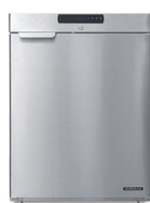
HR24A 23.4" W x 24.5" D x 32.7" H

Offering a wide variety of upright, undercounter, worktop and pretable refrigerators and freezers for your refrigeration storage needs.