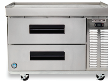
CRES36 36.5" W x 33.25" D x 26" H