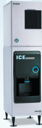
KM-340MAH on DB-130H 22" W x 27.4" D x 30.3" H 22" W x 30" D x 53" H