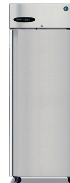
CR1S-FS(L) 27.5" W x 33.75" D x 79.75" H