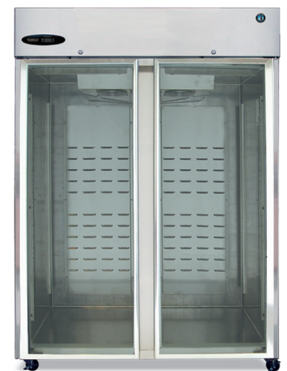
CR2S-FGE 55" W x 34.75" D x 79.75" H