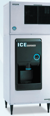
KML-631MAH on DB-200H 30" W x 27.4" D x 26" H 30" W x 30" D x 53" H