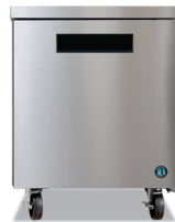
CRMR27 27" W x 30" D x 33.63" H

Offering a wide variety of upright, undercounter, worktop, prep tables and refrigerated equipment stands for your refrigeration storage needs.