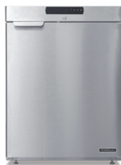
HR24A 23.4" W x 24.5" D x 32.7" H