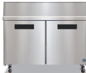
CRMR48-18M 48" W x 30" D x 45.2" H