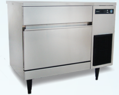
IM-200BAA 39.5" W x 23.6" D x 33.5" H