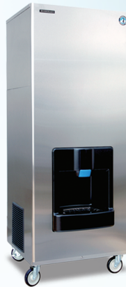
DKM-500BAH 30" W x 28" D x 77" H

Guests, patrons and F&B professionals can enjoy the popular chewable cubelet ice, flaked ice, crystal clear crescent ice or our large square specialty ice.