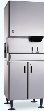
DCM-300-BAH-OS on SD-500 Stand 26" W x 22.5" D x 40" H 25.875" W x 22" D x 32.75" H