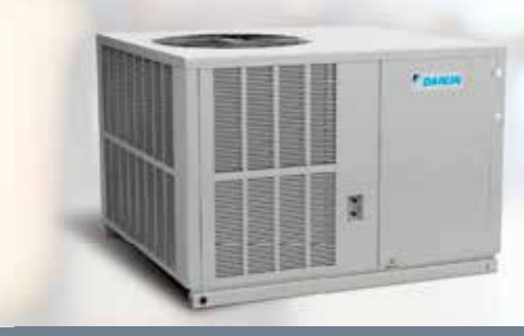
Packaged Unit Models DP13HM , DP13CM , DP13GM