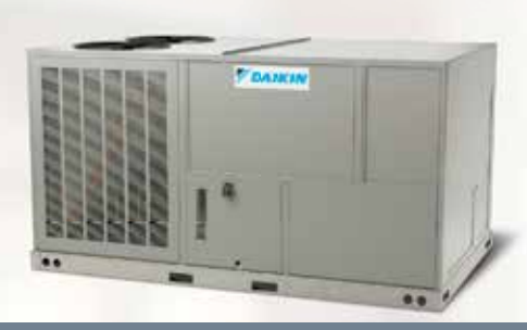
Packaged Unit Models DCC , DCG , DCH (7 ½ - 12 ½ Tons)

Harnessing energy-efficient performance, proven technology, and enhanced Comfort for Life .