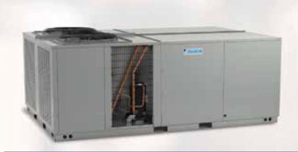
Packaged Unit Models DCC, DCG (25-Tons)