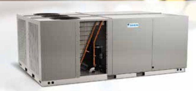
Packaged Unit Models DCC, DCG (15 & 20 Tons)