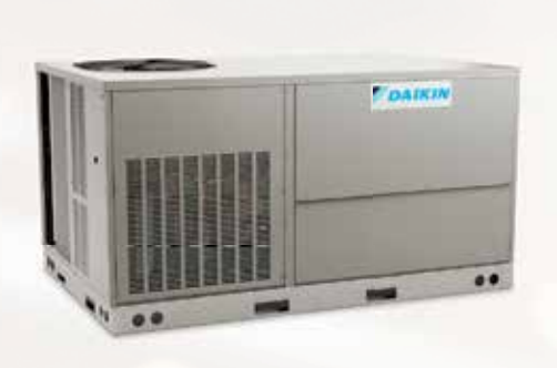
Packaged Unit Models DCC , DCG , DCH (3 - 6 Tons), DT Series (3 - 5 Tons)