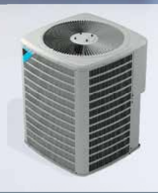
Split System Air Conditioner Models DX13 , DX11 Split System Heat Pump Models DZ13 , DZ11