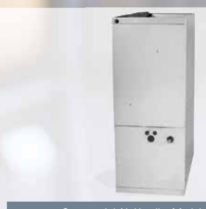
Commercial Air Handler Models DAR, DAT