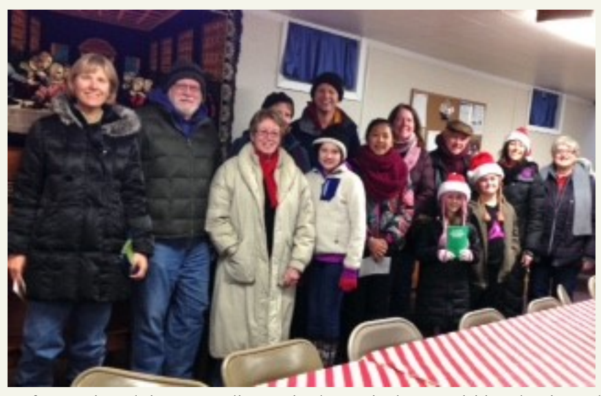
A fun evening Christmas caroling at nine homes in the area visiting shut-ins and other families in the community and bringing baskets of goodies!