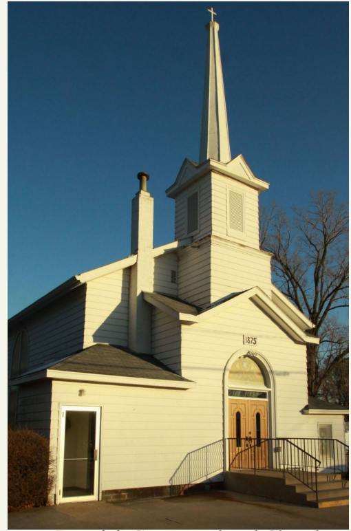
Berwick Congregational Church

SUNDAY SERVICES: & SUNDAY SCHOOL: 9:00 AM