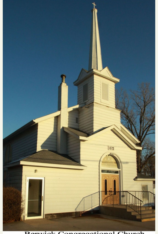
Berwick Congregational Church

SUNDAY SERVICES: & SUNDAY SCHOOL: 9:00 AM