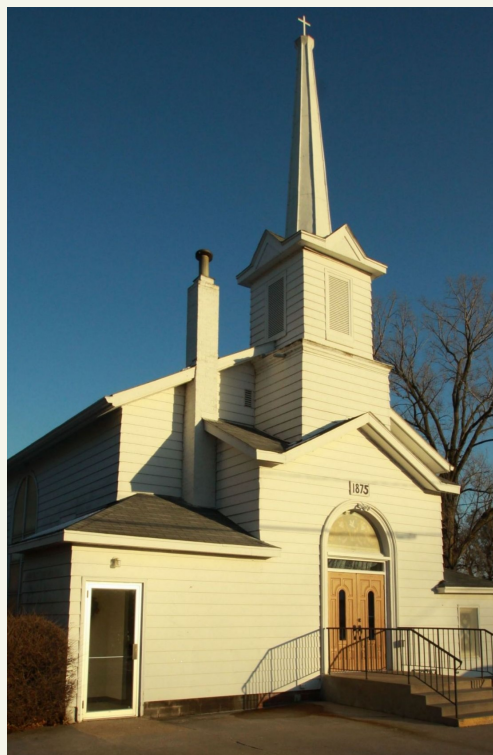
Berwick Congregational Church

SUNDAY SERVICES: & SUNDAY SCHOOL: 9:00 AM