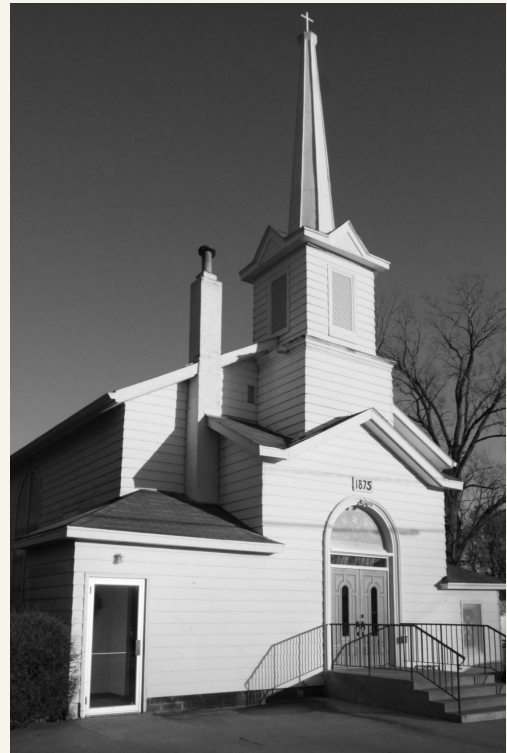
Berwick Congregational Church