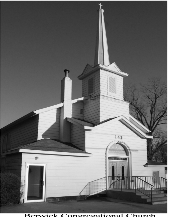
Berwick Congregational Church

A big thank you to Jamie Schramm for updating our website. Please note birthday information will not be included on the website: berwickchurch.com