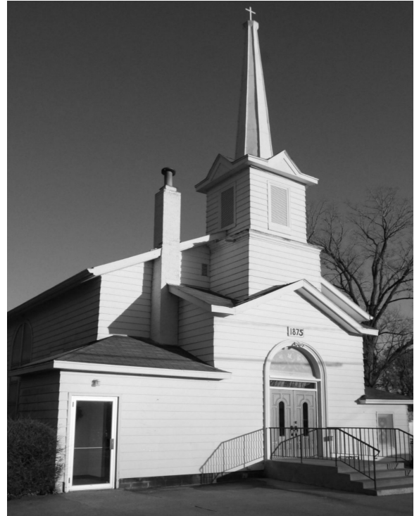
Berwick Congregational Church

A big thank you to Jamie Schramm for updating our website. Please note birthday information will not be included on the website: berwickchurch.com