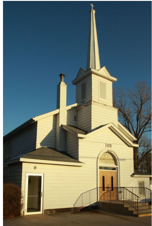
Berwick Congregational Church