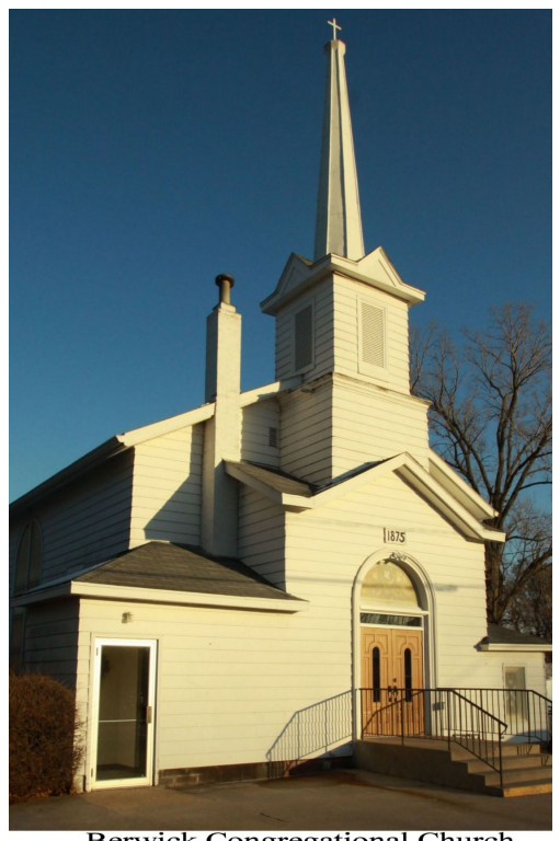
Berwick Congregational Church

October: Happy Life Children's Home—Jonathan Food Co-Op: Canned goods/peanut butter