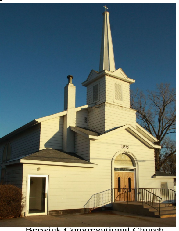
Berwick Congregational Church