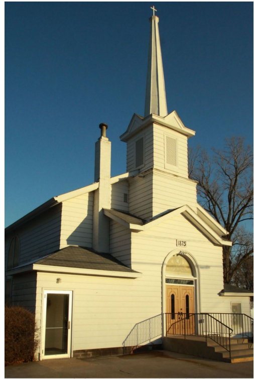
Berwick Congregational Church