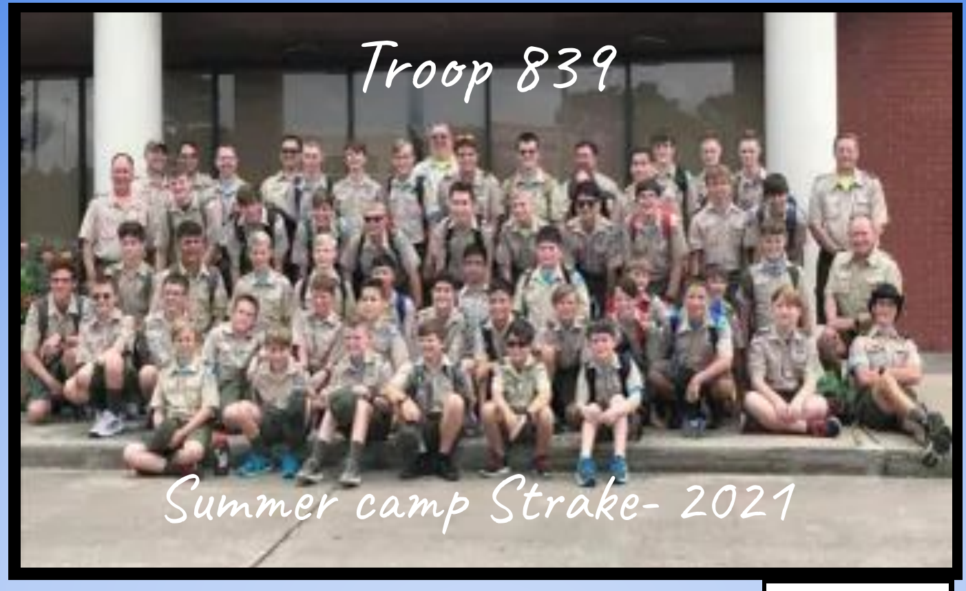
We're going places