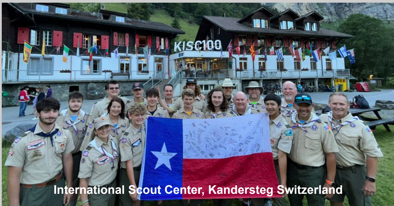
International Scout Center, Kandersteg Switzerland

Troop 839 is a Scout led troop, but the Scouts need adults to make their ideas and plans a reality. There are ongoing volunteer roles and one-time opportunities. Existing opportunities include merit badge counselor, trailer pullers, adult campers, committee members, range safety officers, and more. Sometimes it's as simple as having two adults present to comply the youth protection guidelines. Bottom line....we need parents assistance for the Troop to thrive. Talk to a uniformed adult to arrange joining us at camp or with any volunteer questions.