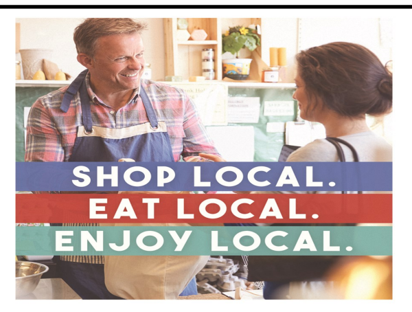
Support our local advertisers Please show your support for your parish by also supporting our advertisers. We wouldn't be able to bring you our bulletin every week without them. Please encourage and remind others to show their support and shop local.

The resurrected Jesus taught the disciples how they were witnesses to the Scriptures being fulfilled in his suffering, death, and resurrection and that forgiveness of sins was to be preached in his name. How might you share your faith this week at home or at work?