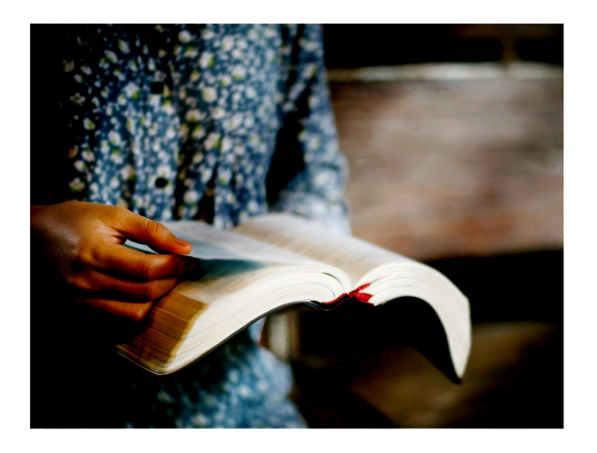
Excerpts from the Lectionary for Mass ©2001, 1998, 1970 CCD. The English translation of Psalm Responses from Lectionary for Mass © 1969, 1981, 1997, International Commission on English in the Liturgy Corporation. All rights reserved.

Acts 4:8-12/Ps 118: 1, 8-9, 21-23, 26, 28, 29 (22)/Jn 3:1-2/Jn 10:11-18