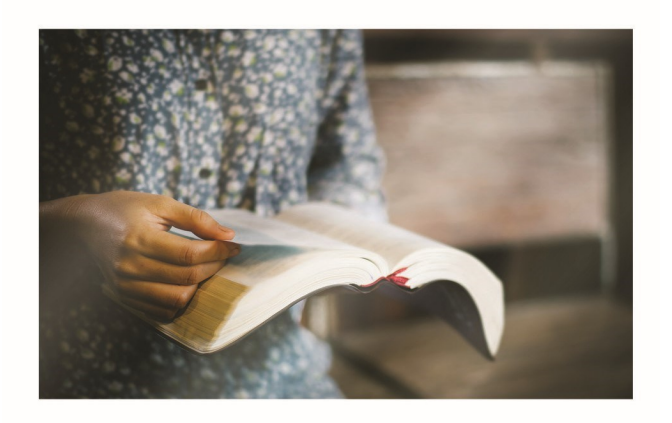
Excerpts from the Lectionary for Mass ©2001, 1998, 1970 CCD. The English translation of Psalm Responses from Lectionary for Mass © 1969, 1981, 1997, International Commission on English in the Liturgy Corporation. All rights reserved.

Ez 33:7-9/Ps 95:1-2, 6-7, 8-9 (8)/Rom 13:8-10/Mt 18:15-20