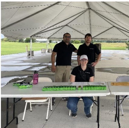
TRSPE Golf outing sign in station.