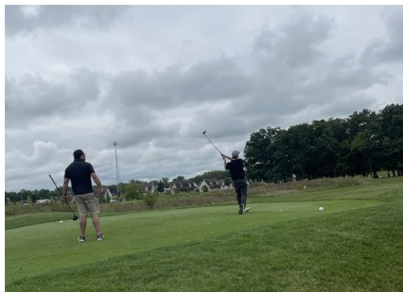
TRSPE Golf outing