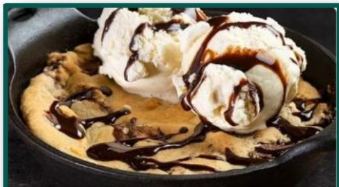
CHOCOLATE CHIP COOKIE SKILLET

O'Charley's Restaurant – Phone: (614) 868-6963 2272 Baltimore-Reynoldsburg Rd. Reynoldsburg, OH 43068