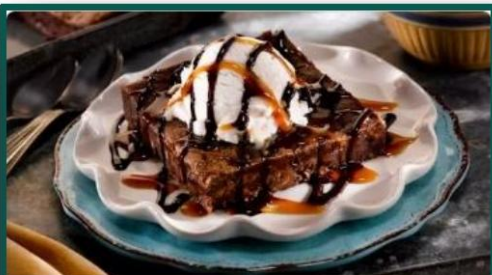
BROWNIE LOVER'S SUNDAE FOR TWO