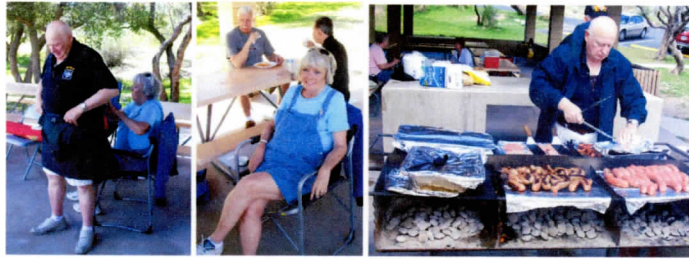
PREPARING A COOK