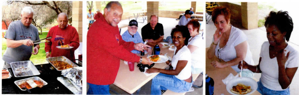
ONE SPECIAL DOG