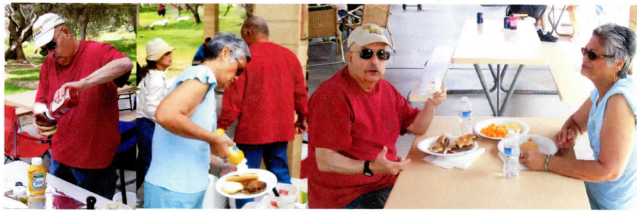
THAT'S THE WAY WE LIKE THEM