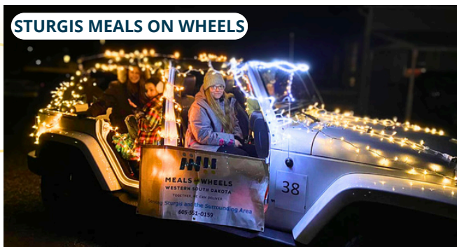
STURGIS MEALS ON WHEELS