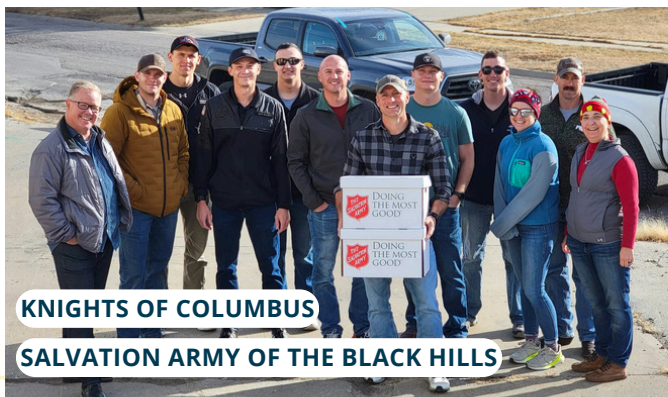
KNIGHTS OF COLUMBUS