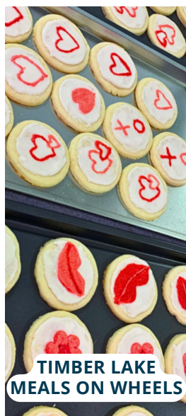
TIMBER LAKE MEALS ON WHEELS