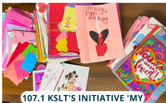
107.1 KSLT'S INITIATIVE 'MY GOLDEN VALENTINE'