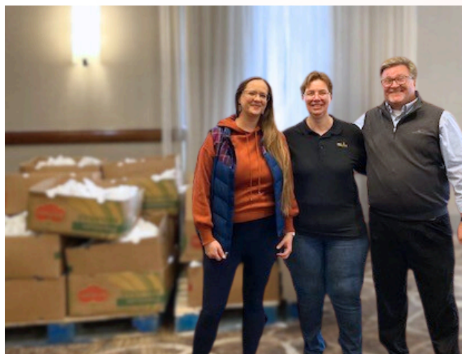
Pennington County Sheriffs Office, Feeding South Dakota, Meals on Wheels Western SD

It is unsure when the residents will be able to return to their homes, but it is guaranteed they will be supplied with 3 meals a day for the duration of their displacement. This is made possible by the good work of the community, Meals on Wheels, and a generous grant through Black Hills Area Community Foundation that will help offset a portion of the disaster costs.