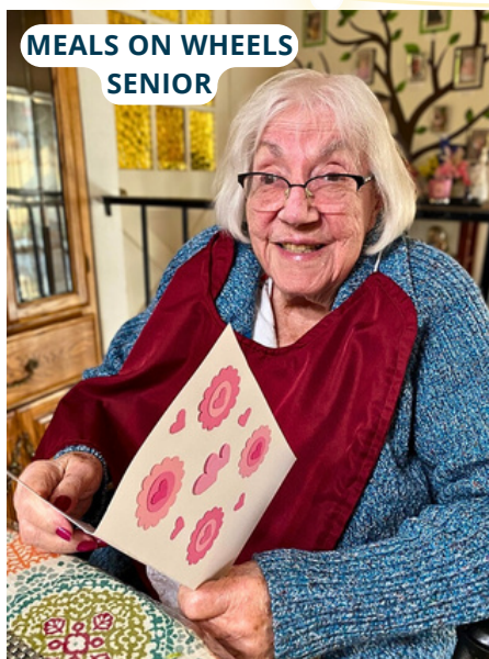
MEALS ON WHEELS SENIOR