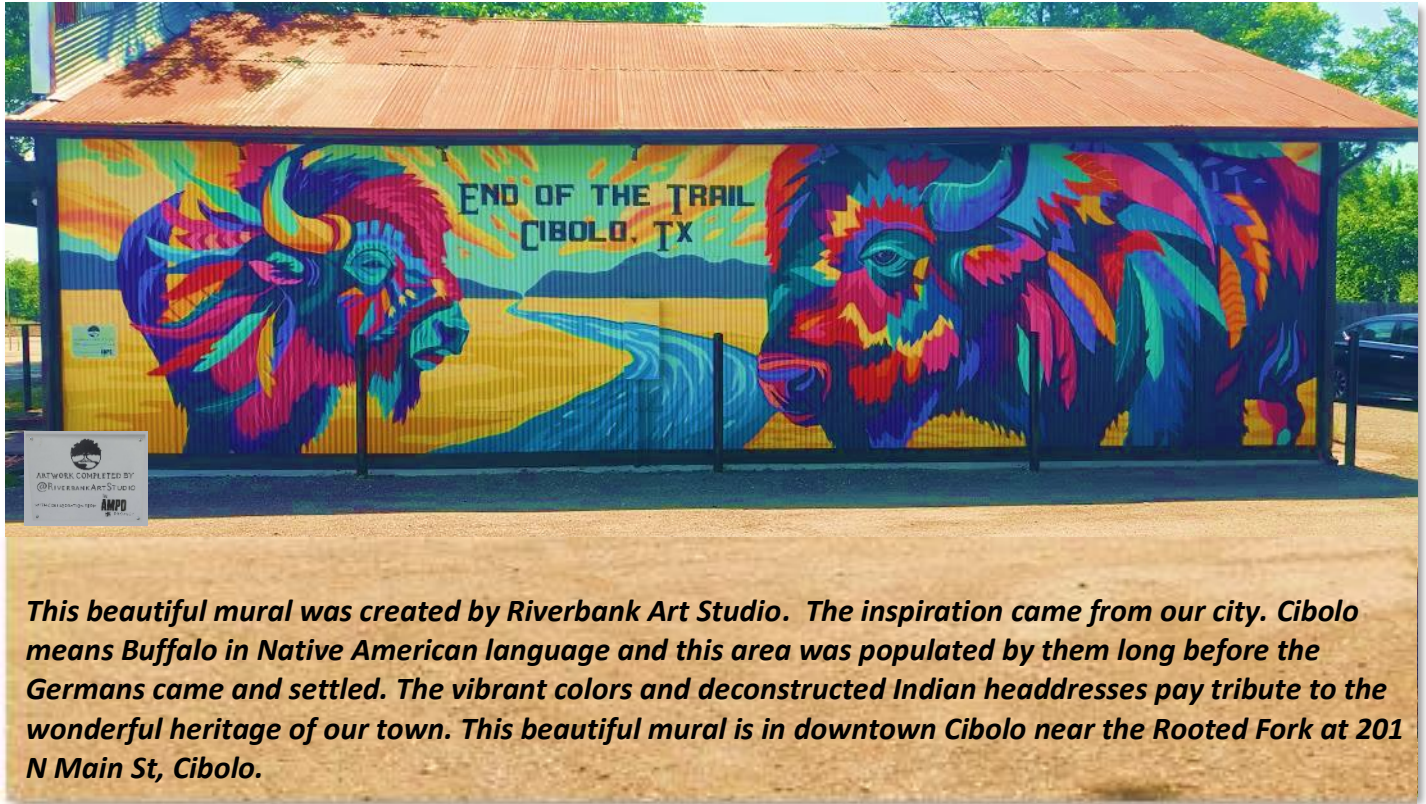
This beautiful mural was created by Riverbank Art Studio. The inspiration came from our city. Cibolo means Buffalo in Native American language and this area was populated by them long before the Germans came and settled. The vibrant colors and deconstructed Indian headdresses pay tribute to the wonderful heritage of our town. This beautiful mural is in downtown Cibolo near the Rooted Fork at 201 N Main St, Cibolo.