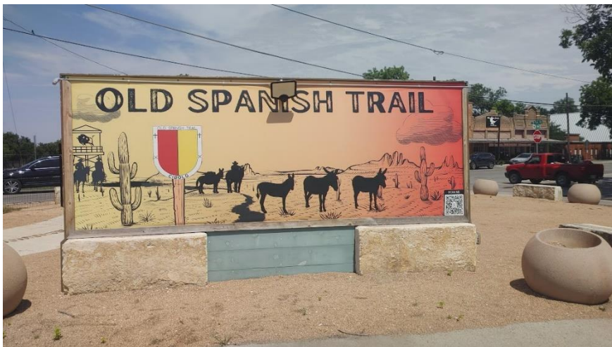
This eye-catching mural captures the spirit of the Old Spanish Trail, representing the era of Spanish exploration and colonization that influenced the development of many Texas towns, including Cibolo. The Spanish legacy is an integral part of the region's cultural and historical backdrop.