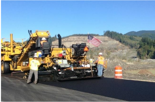
Scheduled CIP Projects FY2024