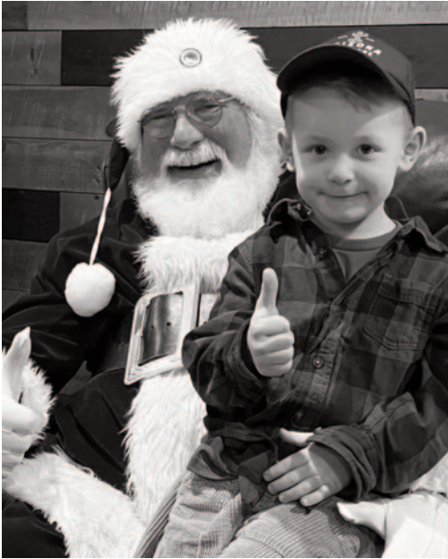
Santa visits with this "Happy Camper" at the Bill's Musky Club "Fishmas Party"