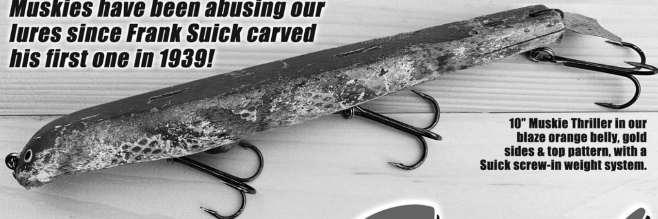
10" Muskie Thriller in our blaze orange belly, gold sides & top pattern, with a Suick screw-in weight system.