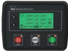
DSE4530 MKII AUTO START & AUTO MAINS FAILURE CONTROL