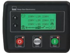
DSE4530 MKII AUTO START & AUTO MAINS FAILURE CONTROL