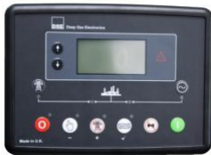
DSE6120 MKII AUTO START & AUTO MAINS FAILURE CONTROL