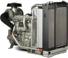
PERKINS Engine 1106A-70TAG4