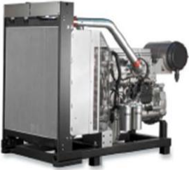
PERKINS Engine 2206C-E13TAG2