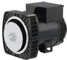
Leroy Somer TAL-A46-H