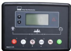
DSE6120 MKII AUTO START & AUTO MAINS FAILURE CONTROL